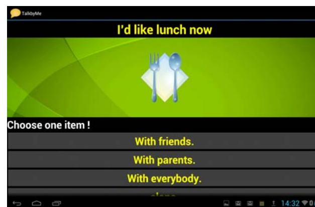
Figure 4 - Screen of Complementary Phrases referred to the Activity Lunch.