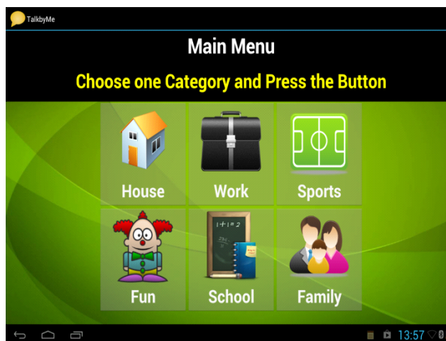
Figure 2 - Screen to choose one category to start the communication process. This screen has icons representing house, work, sports, entertainment, school and family.