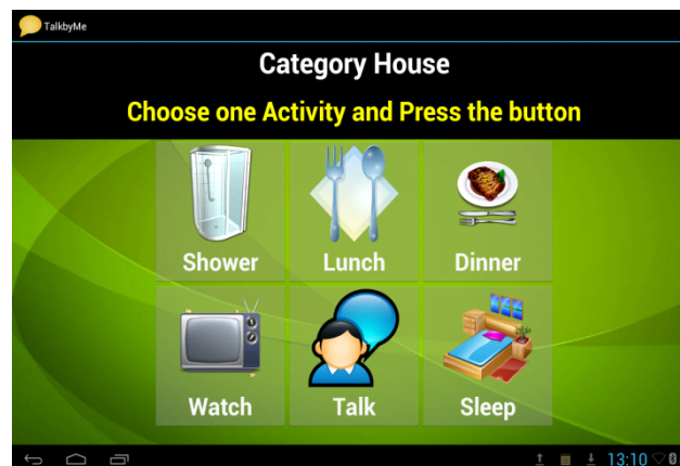
Figure 3 - Screen to choose activity based on Category House. This screen has activities related to take a shower, lunch, dinner, watch TV, conversation, and sleep.